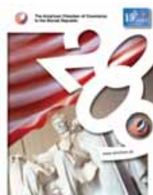
Directory of Members

The American Chamber of Commerce in the Slovak Republic (AmCham) publishes an annual Directory of Members in the English language, a comprehensive list of member companies with all-important con-