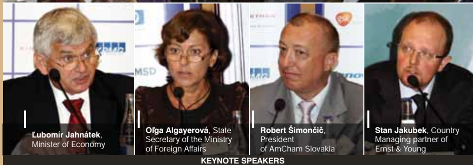
Lubomír Jahnátek, Minister of Economy