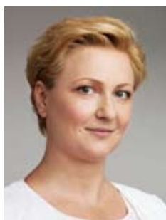
KEYNOTE & PANEL 1