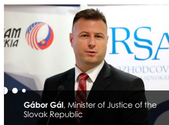
Gábor Gál, Minister of Justice of the Slovak Republic